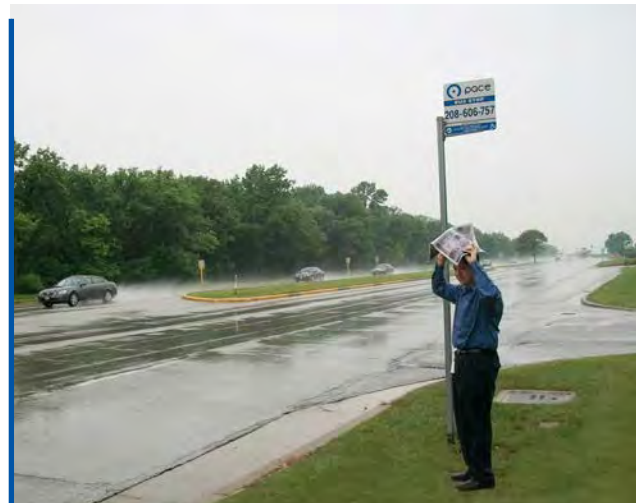
A bus stop shelter sure would have improved this rider's experience. Will he be willing to ride transit in the future?