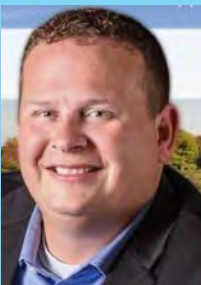
Mayor Hubert E. Hermanek Village of North Riverside

"The Pace Ad Shelter Program offers McHenry residents with shelter from the elements and generates revenue for our city."