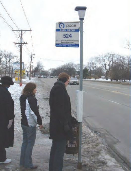
Waiting for the bus on a cold winter morning can be anything but pleasant.