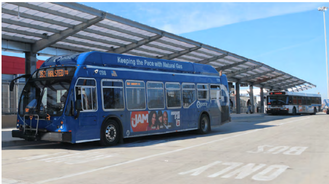
A Pace Route 352 bus dwelling at the new CTA 95th Dan Ryan Red Line station bus terminal.