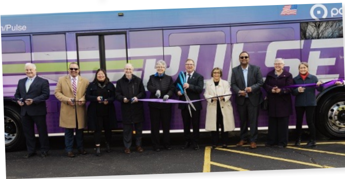
State, county, and local officials join Pace to commemorate launch of daily service on the second Pulse line on November 10, 2023.

The Pulse network is expanding! On October 29, Pace celebrated the launch of the Pulse Dempster Line, the newest addition to its arterial bus rapid transit network. The new service offers a fast, frequent, and reliable way to get to destinations from Evanston to O'Hare Airport. Dempster is the second Pulse Line to launch and connects to the CTA Purple and Yellow Lines; Metra Union Pacific North, Union Pacific Northwest, and North Central Service lines; and Pace's Pulse Milwaukee Line. Leveraging Transit Signal Priority (TSP) technology, which extends green lights for buses at intersections, Pulse efficiently navigates through traffic with up to 15 minutes in reduced travel times.