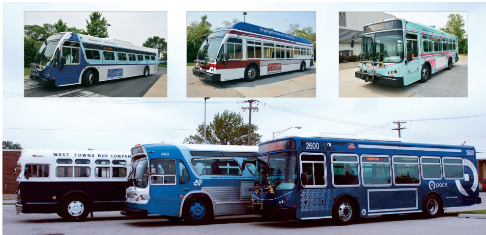
Above: Legacy Fleet wraps from 2019 of West Towns, South Suburban Safeway, and Suburban Transit Below: Vintage 1949 West Towns and 1975 NORTRAN buses, beside a 2006 Pace bus

For our 35th anniversary in 2019, one bus in each garage division was wrapped to look like the companies that preceded Pace. Thank you for sharing so many transit memories with us on social media, where we post images from our history every Thursday!