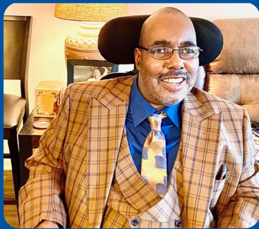
Message from the Chicago ADA Advisory Committee Chairman:

Spring is here and I hope everyone is safe. I really enjoyed being the Pace Chair of the Chicago ADA Advisory committee and I hope things continue to get better for the people who use the ADA Paratransit services. Always remember the customer's opinion matters and have a wonderful Spring.