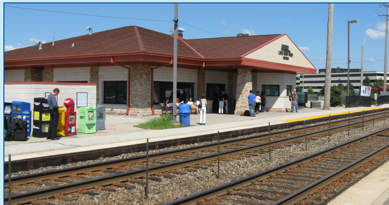
The VanGo van is parked at the Lake-Cook Rd Metra station at 601 Lake Cook Rd., Deerfield.