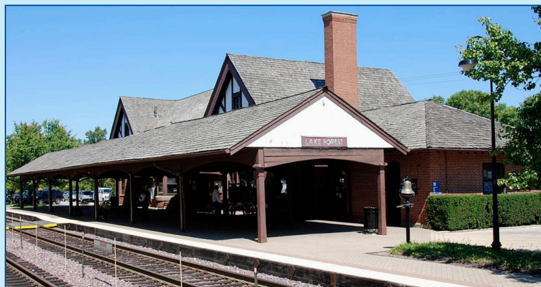
The VanGo van is parked at the Lake Forest Metra station at 691 N. Western Ave.