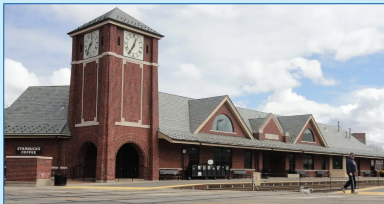
The VanGo van is parked at the Palatine Metra station at 137 W. Wood St.